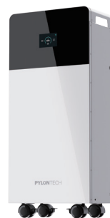
Fidus Battery Plus